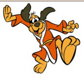
1; Name the superhero and his real identity 2 points