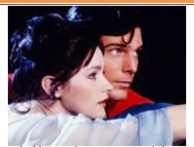
2; Name the actors and the DC Comics characters for 4 points