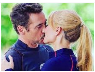
8; Name the actors and the Marvel characters for 4 points