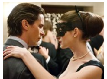
11; Name the actors and the DC Comics characters for 4 points