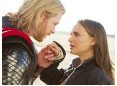
5; Name the actors and the Marvel characters for 4 points